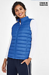
SOL'S WILSON BW WOMEN 02890