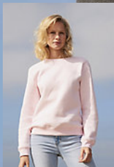
SOL'S SULLY WOMEN 03104